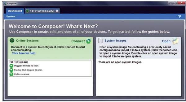
Dashboard makes it easy to connect, indicates configuration errors and allows downloading configuration files without allowing access to setup.