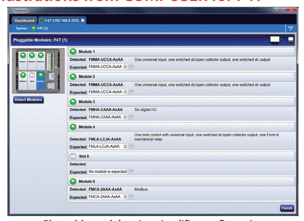
Pluggable modules view simplifies configuration by showing hardware present.