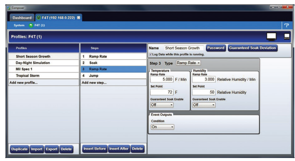
Profile editor speeds up creating and editing profiles.

Watlow*, COMPOSER*, INTUITION* and EZ-ZONE* are registered trademarks of Watlow Electric Manufacturing Company. Windows* is a registered trademarks of the Microsoft Corporation.